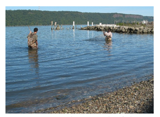
Yonkers is on the east side of the Hudson at Hudson River Mile 18.