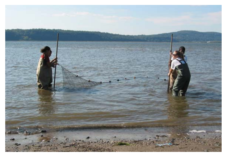
Seine nets can be used to catch fish in shallow water.

During the Day in the Life of the Hudson River event each fall, students catch fish at many places along the river. Then they compare results to see where different kinds of fish live. The location of each place is given in Hudson River Miles . River Mile 0 is in New York City. Going north towards Albany, the mile numbers get higher. Yonkers is at Hudson River Mile 18. Beacon is at Hudson River Mile 61.