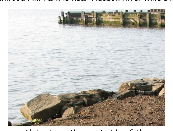
Alpine is on the west side of the Hudson at Hudson River Mile 18.