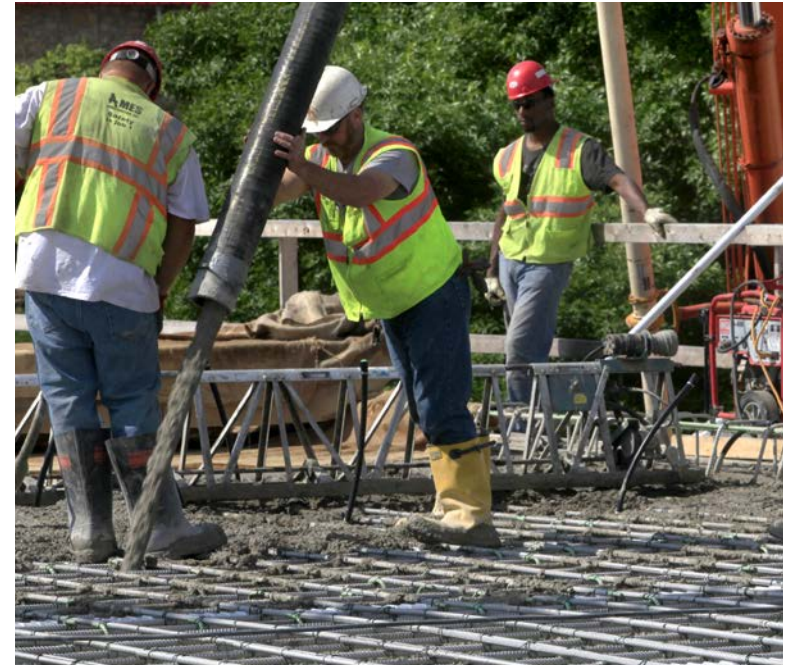
Workers pour concrete over the steel bars.

Steel bars are placed between the girders. The steel bars make the concrete stronger. Concrete is poured over the steel bars. The concrete gets hard. Finally, the new bridge is ready for traffic.