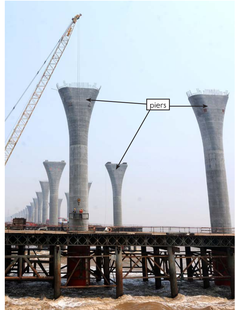
Installing bridge piers

Next, workers build piers. They are like the legs on a table. They will hold up the bridge.