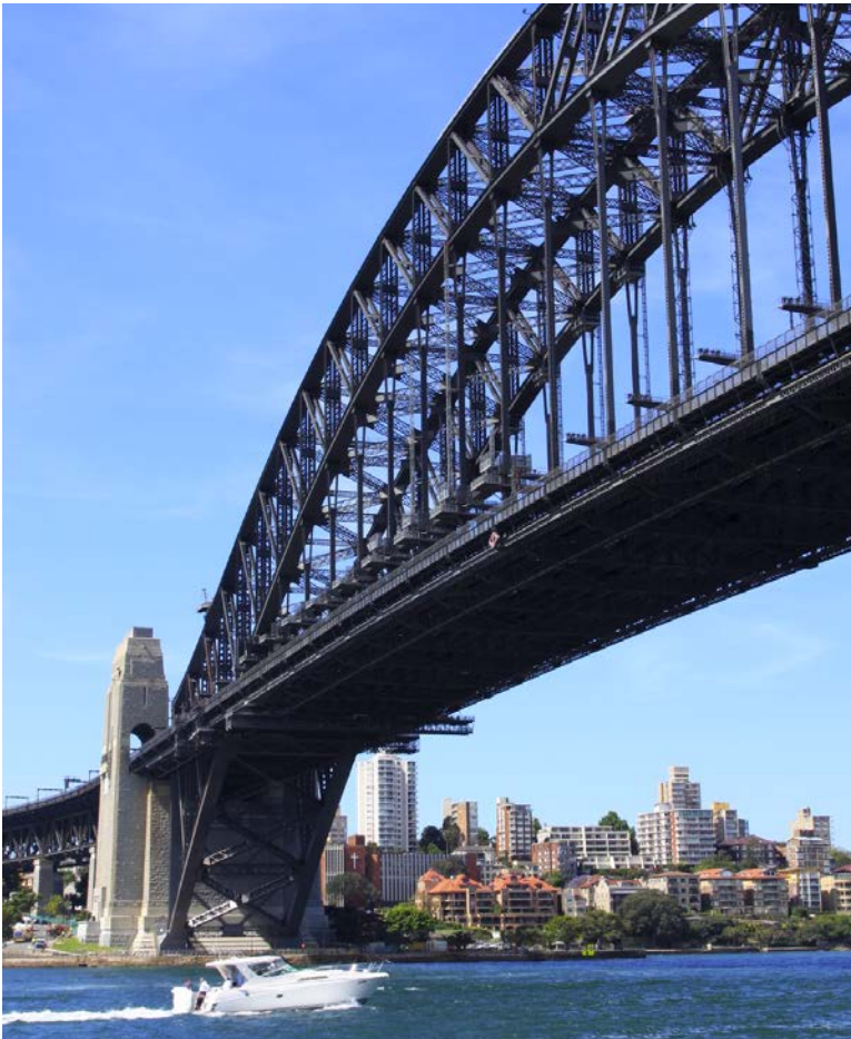
Sydney Harbor Bridge, Sydney, Australia

The first bridges were made out of wood, rope, or stone. Today, most bridges are made of steel and concrete.