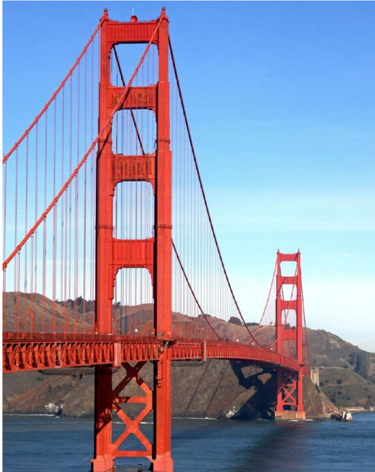
Golden Gate Bridge, San Francisco, California

Bridges go over rivers and lakes. They go over bays and swamps. They go over highways and railroads. Some even float.