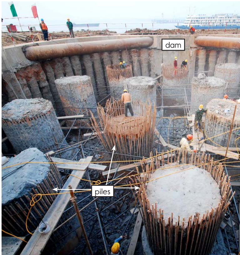
Inside a dam

Next, workers put supports across the piles. The supports are built under water using a special dam. A dam holds the water back. The workers can work where it is dry.