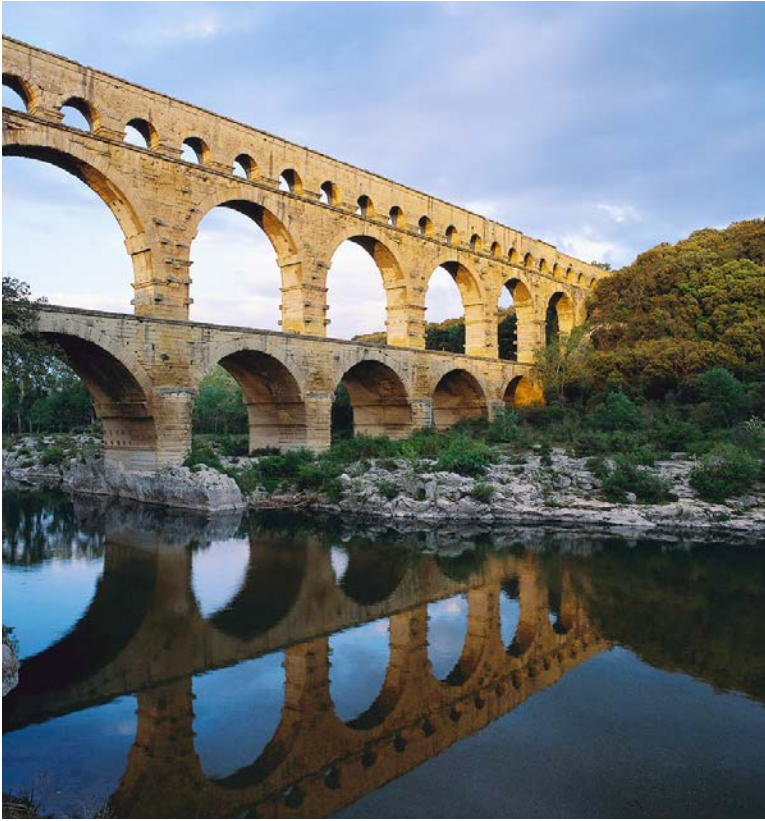
Pont du Gard Aqueduct near Nimes, France

Later, stones were used to build stronger and longer bridges. In time, people were building bridges like the ones we see today. These are made of concrete and steel. They go across longer distances.