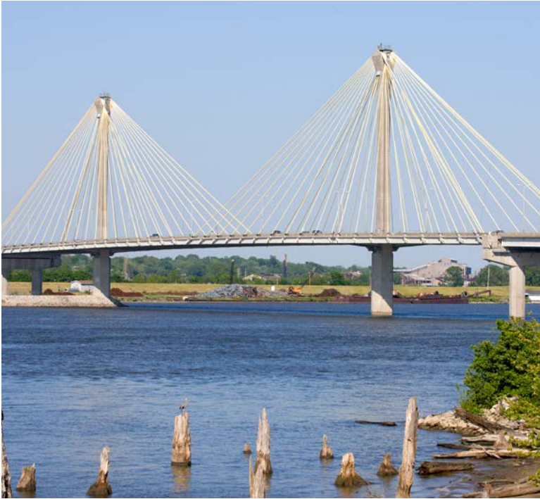
The Clark Bridge over the Mississippi River at Alton, Illinois.

Building bridges is a big job. It can take many years. It can cost millions of dollars. It can take many workers to build a bridge. Let's look at a bridge being built over a river.