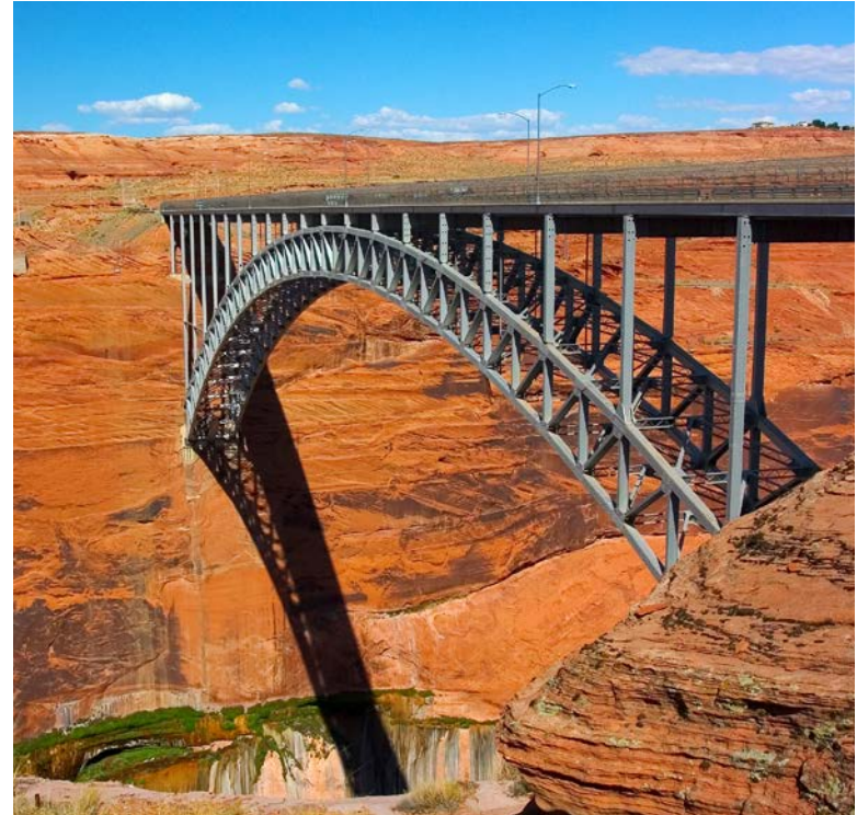
Glen Canyon Dam Bridge, Arizona

Bridges go over rivers and lakes. They go over bays and swamps. They go over highways and railroads. Some even float.