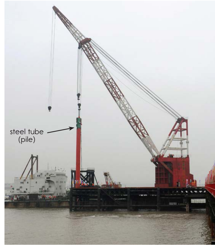
Steel tubes being hammered into the river bottom

Building bridges is a big job. It can take many years. It can cost millions of dollars. It can take many workers to build a bridge. Let's look at a bridge being built over a river.