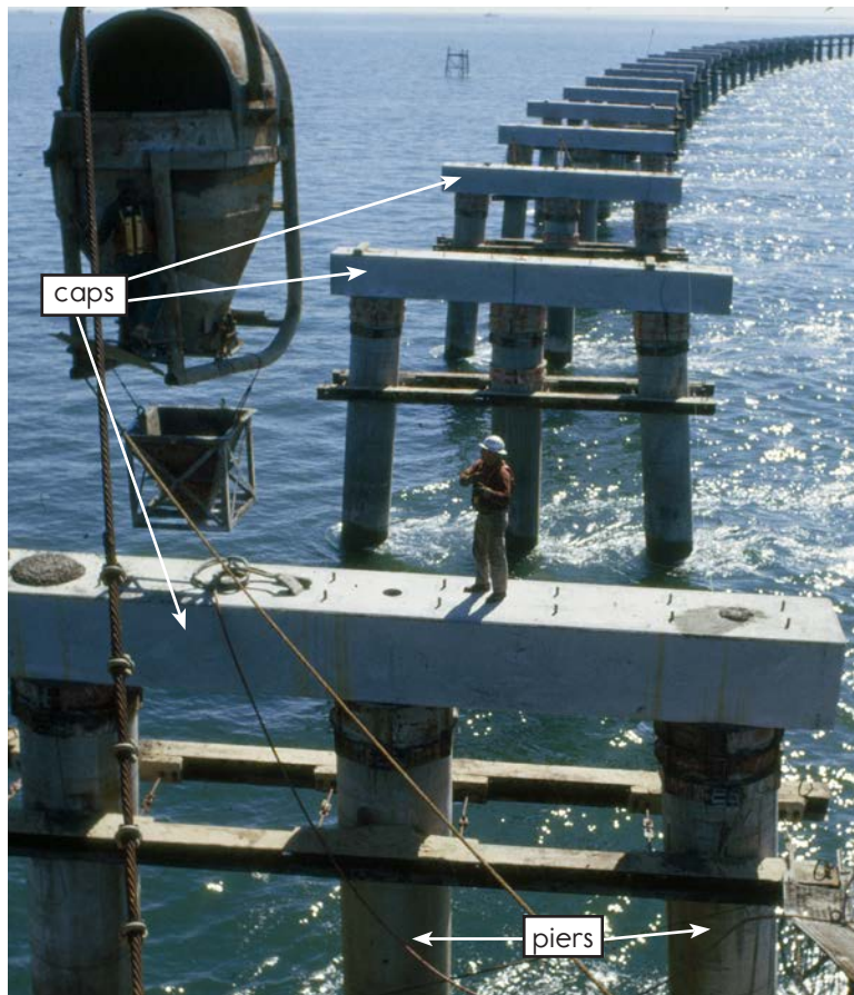
Cap being put into place

Then caps are put on the tops of the piers. Concrete pieces, called girders , are put between two piers. The girders hold up the roadway.